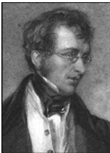
Thomas Fowell Buxton

Wilberforce's Bill of 1807 made the trade in slaves illegal